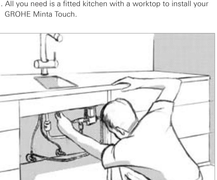
3. Connect the fitting to your water connections as usual. Now connect the EasyTouch technology battery-operated control unit between fittings and cold-water connection. Done.