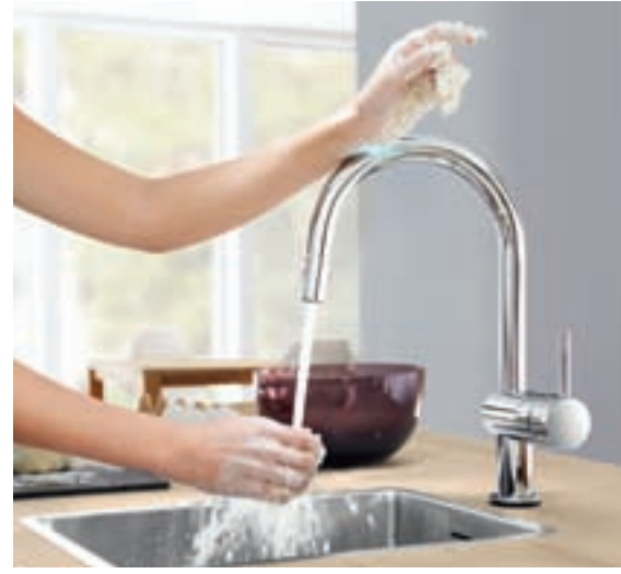
Simple activation/deactivation of the waterflow by touch.

If your hands are clean, simply use the manual lever to adjust flow and temperature. GROHE Minta Touch is simple, sensual, moving – a hybrid faucet that intelligently unites two operating functions.