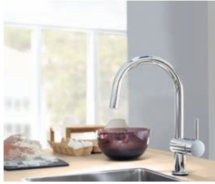
1. GROHE Minta Touch – beautiful and functional.

GROHE Minta Touch will also save you plenty of cleaning time, as the lever remains spotless and bacteria-free all day, every day – regardless of the number of helping hands you have in your kitchen.