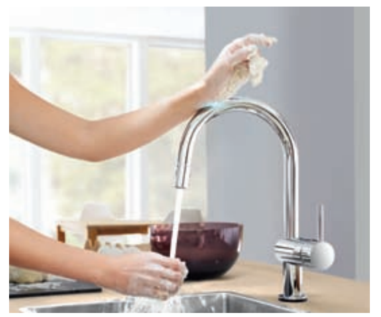
4. Clean hands, clean fittings.