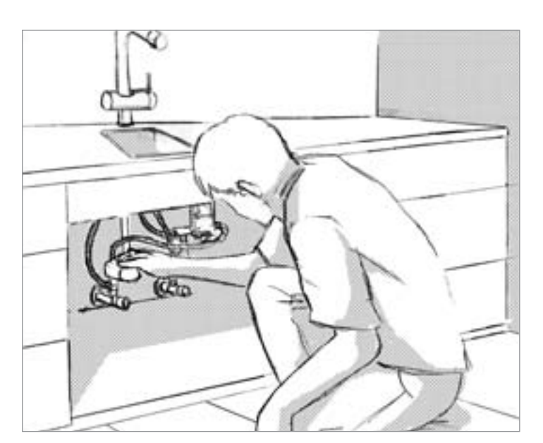
4. You can also install the Grohtherm Micro within seconds. Simply integrate the installation attachment with the EasyTouch function to get warm water at the desired temperature.