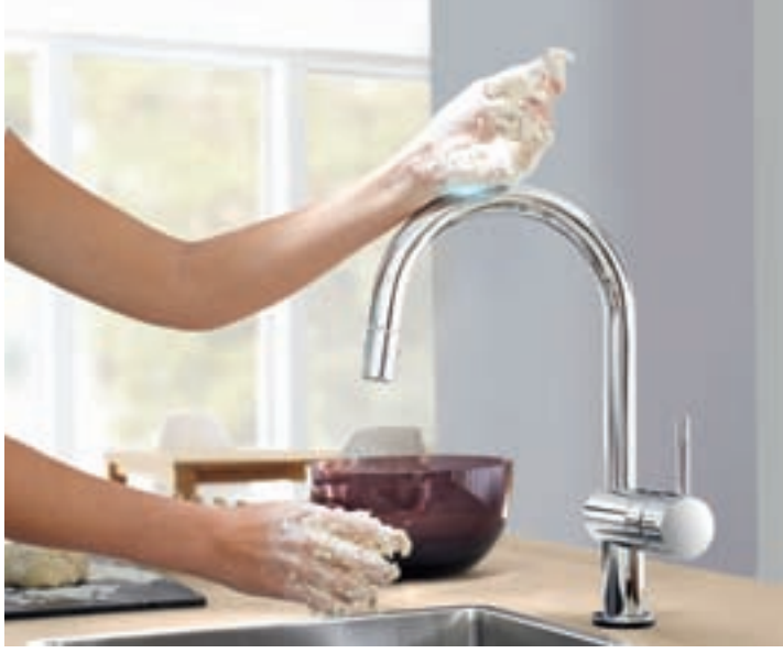
2. Dirty hands? Clean fittings.