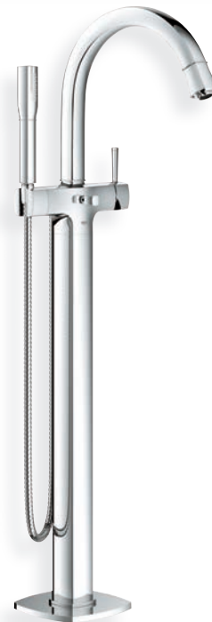
23 318 000* + 45 984 000 Bath/shower mixer floor mounted ● ● ● ●