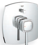
19 920 000 + 35 501 000 Bath/shower mixer ● ●