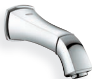
13 341 000 Bath spout ● ●