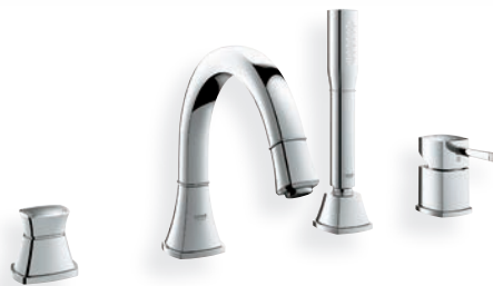
19 936 000* 4-hole bath combination can be used along with 29 037 000 ● ● ● ●