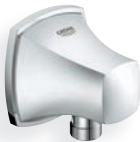
27 970 000 Shower outlet elbow ●●●