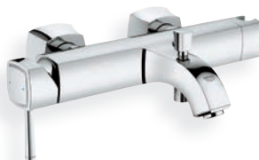
23 317 000 Bath/shower mixer ● ●