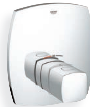
19 941 000* + 35 500 000 Central thermostat ● ●