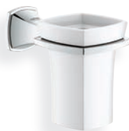
40 626 000 Holder + Tumbler ● ● ●