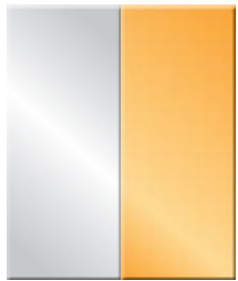
● Chrome / Gold – IG0

Bright and precise – the Grandera™ collection in the chrome finish casts your bathroom in a very special light. And for a very, very long time. GROHE SilkMove® technology ensures ultimate ease of use.