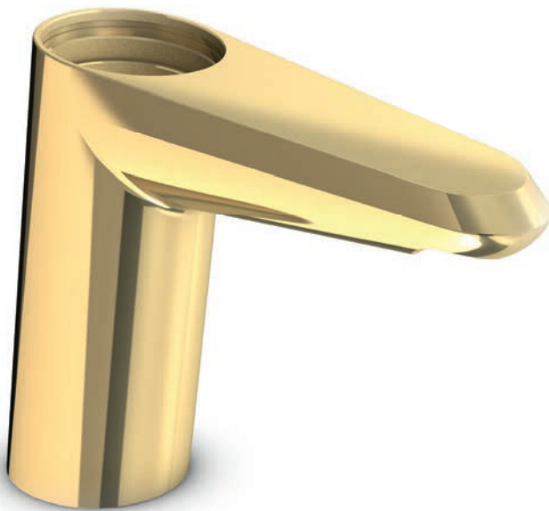
GROHE Zero New Eurodisc Cosmopolitan produced with GROHE Zero.

More importantly, the new GROHE Zero alloy ensures unprecedented longevity. Its composition has been proven to be five times more resistant to corrosion. With a GROHE Zero faucet, you can be sure you will revel in the pure enjoyment of water in every aspect – day after day and for a whole lifetime.