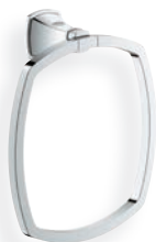
40 630 000 Towel ring ● ● ●