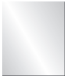
● Chrome – 000