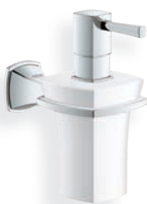
40 627 000 Shelf + Soap dispenser ● ● ●