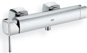
23 316 000 Shower mixer ● ●