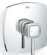
19 932 000 + 35 501 000 Shower mixer ● ●