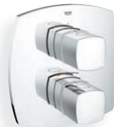
19 934 000 + 35 500 000 Thermostatic shower mixer ● ●