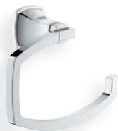
40 625 000 Toilet paper holder ● ● ●