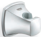
27 969 000 Hand shower holder ●●●