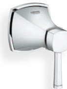
19 944 000 + 29 032 000 Concealed valve ● ● ●