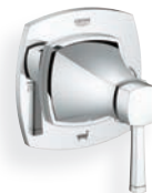
19 942 000 + 29 708 000 5-way diverter ● ● ●