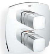
19 948 000 + 35 500 000 Thermostatic bath/shower mixer with 2 way diverter ● ●