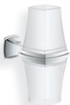
40 661 000* Lamp ● ● ●