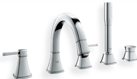
19 919 000* 5-hole bath combination can be used along with 29 037 000 ● ● ● ● ●