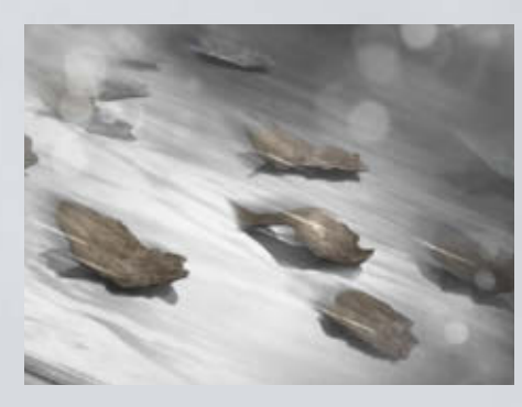
surface with AquaCeramic