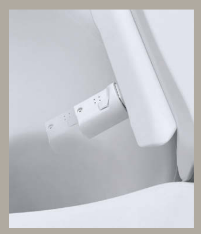
Adjustable shower arm position.

your ideal spray position. Adapt the exact spray arm position for great performance every time.