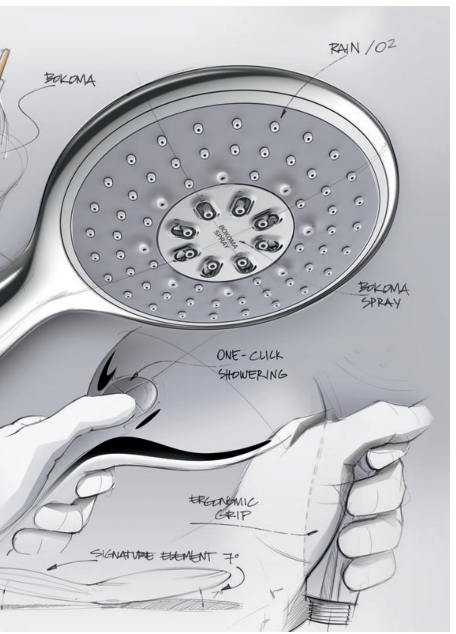
grohe.com | GROHE Power&Soul® | Page 9