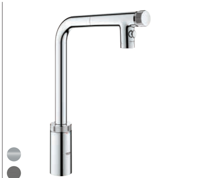
31 889 000 | Minta SmartControl | L-spout | Pull-out mousseur | Dual Spray