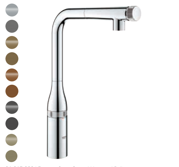
31 615 000 | Essence SmartControl | L-spout | Pull-out mousseur