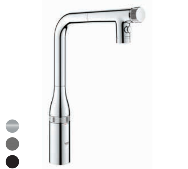
31 892 000 | Essence SmartControl | L-spout | Pull-out mousseur | Dual Spray