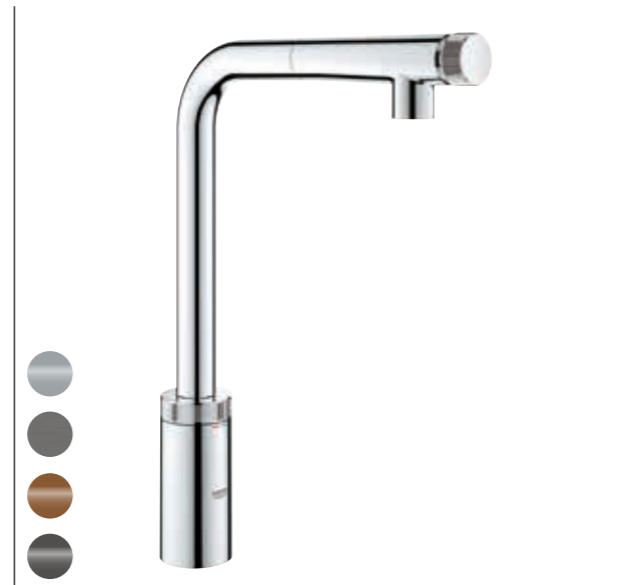
31 613 000 | Minta SmartControl | L-spout | Pull-out mousseur