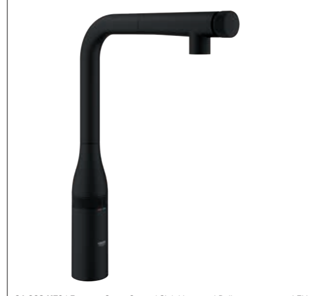
31 928 KF0 | Essence SmartControl Sink | L-spout | Pull-out mousseur | EU