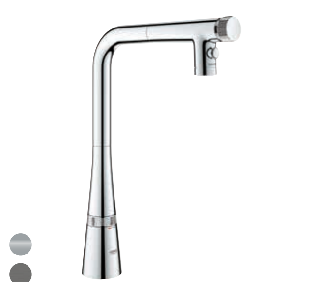
31 886 000 | Zedra SmartControl | L-spout | Pull-out mousseur | Dual Spray