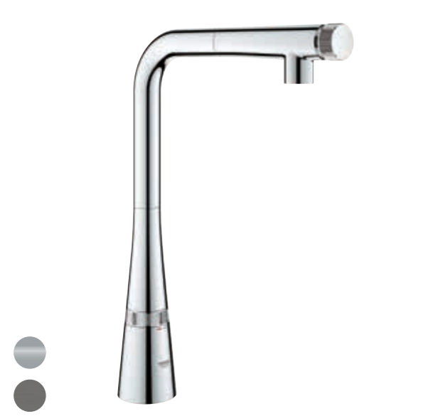
31 593 002 | Zedra SmartControl | L-spout | Pull-out mousseur