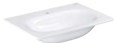
39 564 00H Wall hung basin 70 cm 39 565 00H 60 cm