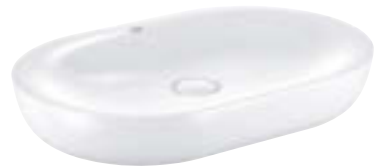
39 608 00H Vessel 60 cm