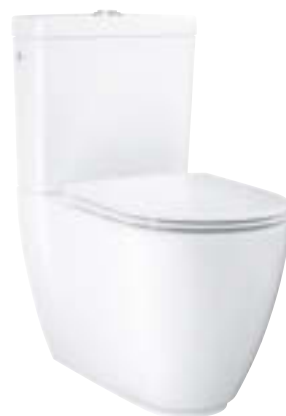
39 572 00H Floorstanding WC 39 579 000 Cistern with bottom inlet 39 578 000 Cistern with side inlet 39 576 000 Seat & cover 39 577 000 Soft close