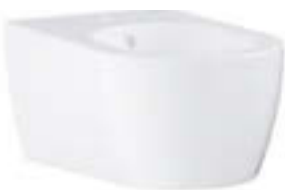
39 574 00H Wall hung bidet