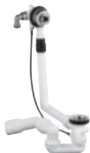
28 991 000 Talentofill inlet waste & overflow valve