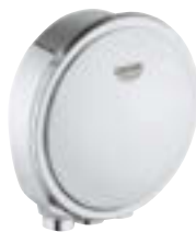
19 952 000 Talentofill trimset for waste set