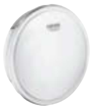
19 025 000 Talento trimset for waste set