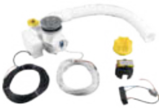
49 113 000 / SH0 Waste set for free standing bath tub