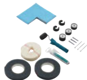
49 114 000 Sealing system