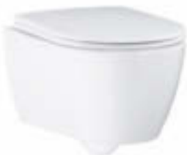
39 571 00H Wall hung WC 39 576 000 Seat & cover 39 577 000 Soft close