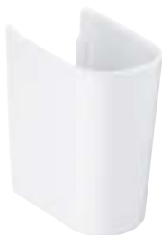
39 570 000 Half Pedestal for wash basins