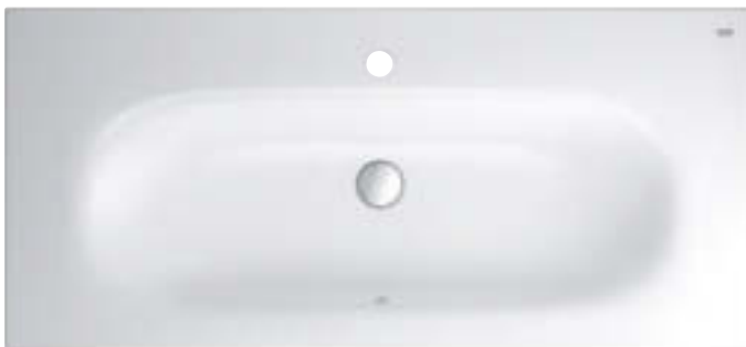
39 566 00H Vanity basin 100 cm 39 567 00H 80 cm 39 568 00H 60 cm