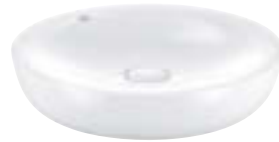
39 609 00H Vessel 45 cm

With Essence you will find all the power, performance and clever details you expect, concealed within an astonishingly slim, sleek, elegantly organic exterior.