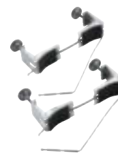
49 115 000 / SH0 Feet for built-in bath tub