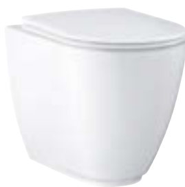
39 573 00H Floorstanding WC back to wall 39 576 000 Seat & cover 39 577 000 Soft close