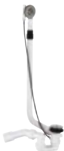
28 943 000 Talento pop-up waste