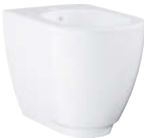
39 575 00H Floorstanding bidet