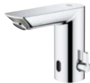
36 451 000 Touchless basin mixer (battery operated)

Unique low-energy electronics ensure a long service life.