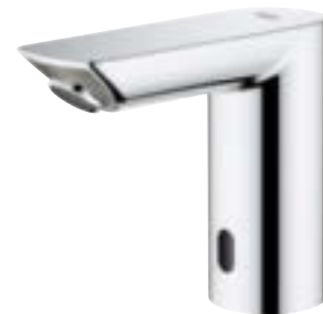
36 452 000 Touchless basin tap (battery operated)