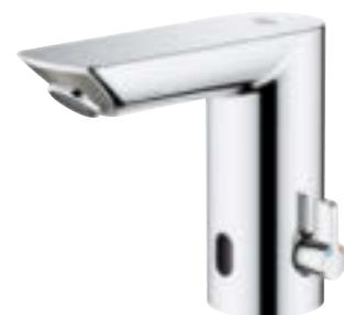
36 453 000 Touchless basin mixer (with plug transformer 100 – 230 V AC)