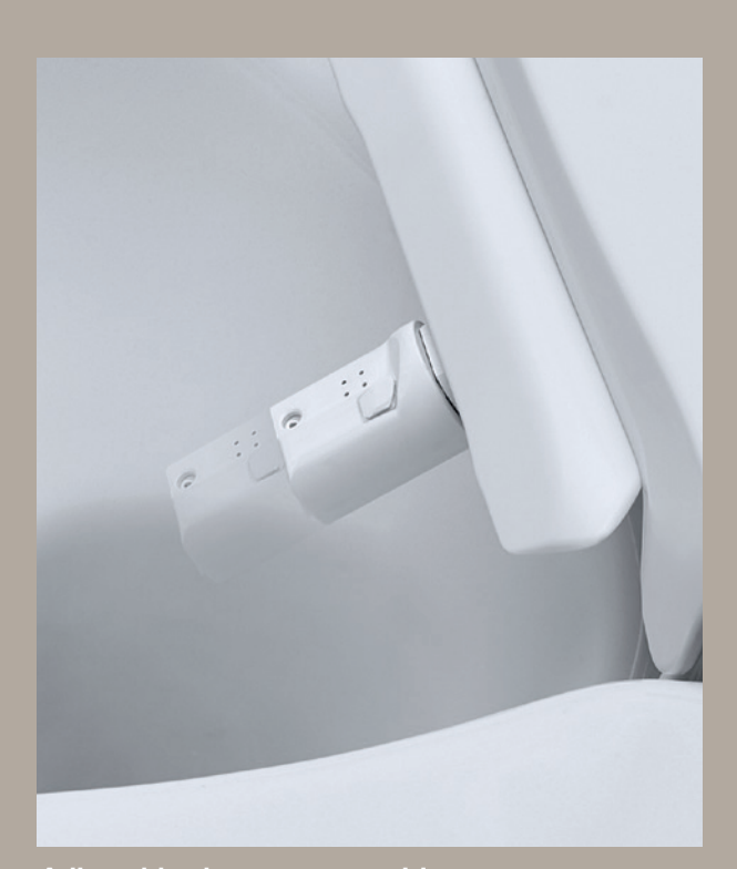
Adjustable shower arm position.

unlimited warm water. Thanks to the Spalet's instant heating system you can enjoy constant, unlimited warm water for your complete comfort.