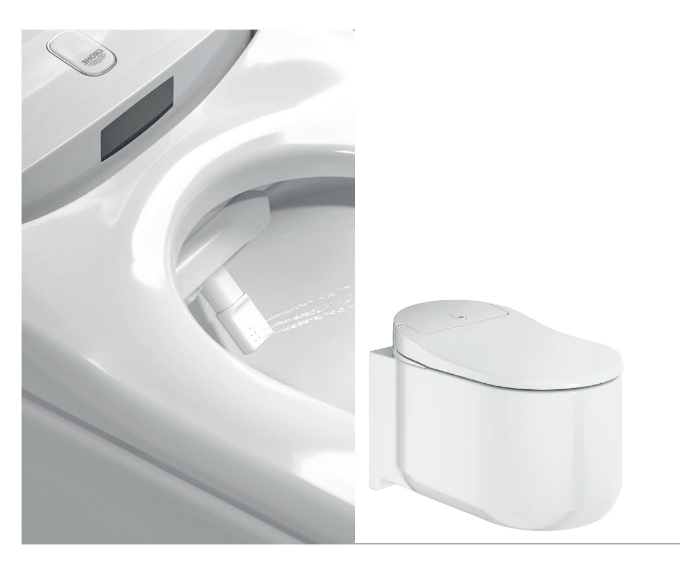
39 354 SH0 Sensia® Arena shower toilet wall-mounted