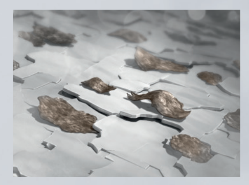
surface without AQUACERAMICS