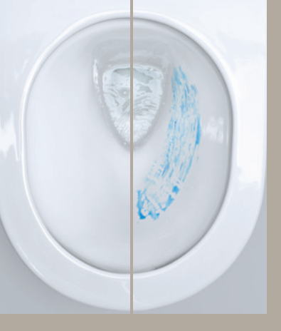
WITHOUT AQUACERAMICS AQUACERAMICS