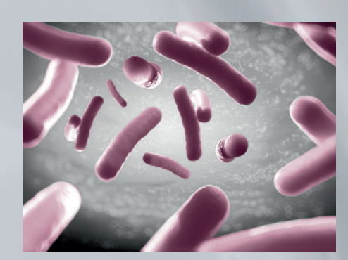
surface without HYPERCLEAN