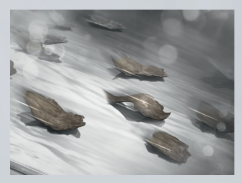
surface with AQUACERAMICS