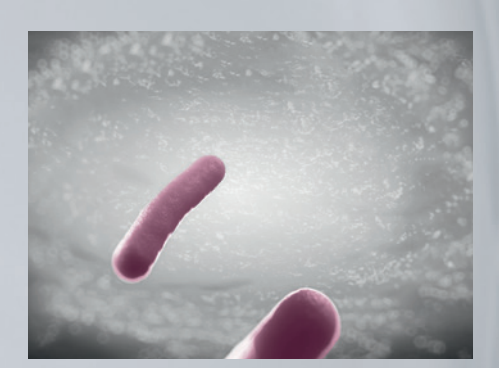
surface with HYPERCLEAN