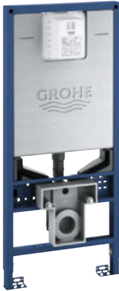
39 597 000 Rapid SLX WC 3-6 | 1.13 m, without outlet pipe

Rapid SLX Element for WC, 1.13 m installation height with flushing cistern GD2, with electric socket, including flow manager, easy access and fully insulated against condensation. Without outlet pipe.