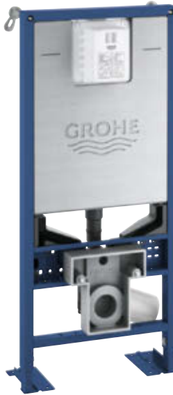
39 599 000 Rapid SLX WC 3-6 | 1.13 m F with heavy load feet

Rapid SLX Element for WC, 1.13 m installation height with flushing cistern GD2, with electric socket, including flow manager, easy access and fully insulated against condensation. Without outlet pipe.