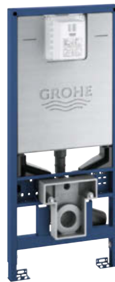
39 602 000 Rapid SLX WC 3-6 | 1.13 m US

Rapid SLX Element for WC, 1.13 m installation height with flushing cistern GD2, with electric socket, including flow manager, easy access. Including pipe-in-pipe connection.