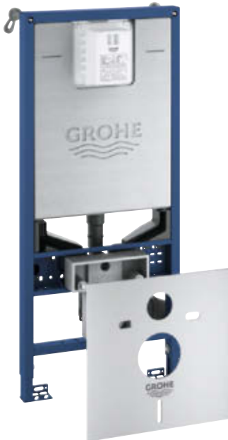
39 598 000 Rapid SLX 3in1 WC 6 | 1.13 m with wall brackets and noise protection

Rapid SLX Element for WC, 1.13 m installation height with flushing cistern GD2, with electric socket, including flow manager, easy access. Specifically for Saudi Arabia with different settings.