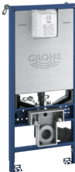
39 600 000 Rapid SLX WC 3-9 | 1.13 m SC Nordics adapter

Rapid SLX Element for WC, 1.13 m installation height with flushing cistern GD2, with electric socket, including flow manager, easy access and fully insulated against condensation. With wall brackets and noise protection.