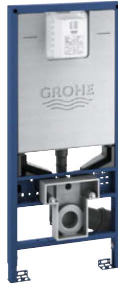
39 601 000 Rapid SLX WC 3-6 | 1.13 m, SASO

Rapid SLX Element for WC, 1.13 m installation height with flushing cistern GD2, with electric socket, including flow manager, easy access and fully insulated against condensation. With heavy load feet.