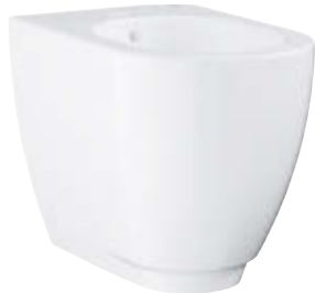
39 575 00H Floorstanding bidet