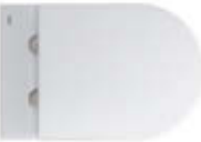
39 571 00H Wall hung WC