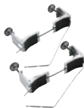
49 115 000 / SH0 Feet for built-in bath tub

39 617 000 Built-in bath tub 180 x 80 x 45 cm 39 619 000 Antislip 39 620 00H EasyClean 39 621 00H Antislip EasyClean