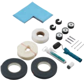
49 114 000 Sealing system