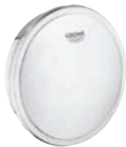
19 025 000 Talento trimset for waste set