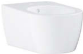
39 574 00H Wall hung bidet