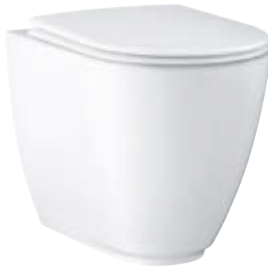
39 573 00H Floorstanding WC back to wall 39 576 000 Seat & cover 39 577 000 Soft close