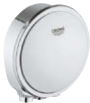
19 952 000 Talentofill trimset for waste set