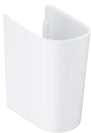
39 570 000 Half Pedestal for wash basins