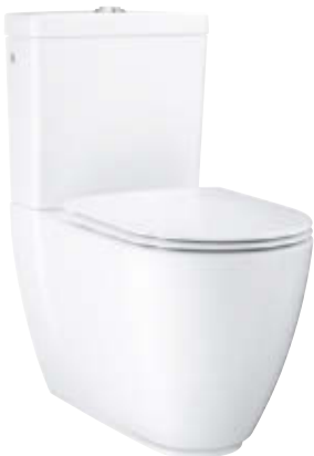
39 572 00H Floorstanding WC 39 579 000 Cistern with bottom inlet 39 578 000 Cistern with side inlet 39 576 000 Seat & cover 39 577 000 Soft close