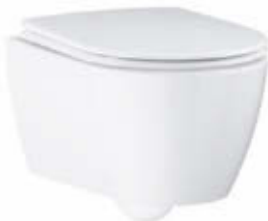
39 571 00H Wall hung WC 39 576 000 Seat & cover 39 577 000 Soft close