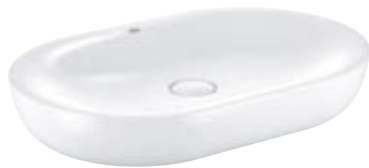
39 608 00H Vessel 60 cm