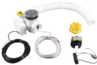
49 113 000 / SH0 Waste set for free standing bath tub

39 622 000 Back-to-wall bath tub 180 x 80 x 57,5 cm 39 623 000 Drilled tap hole 39 649 00H EasyClean 39 650 00H Drilled tap hole EasyClean