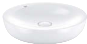
39 609 00H Vessel 45 cm

With Essence you will find all the power, performance and clever details you expect, concealed within an astonishingly slim, sleek, elegantly organic exterior.