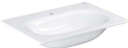
39 564 00H Wall hung basin 70 cm 39 565 00H 60 cm