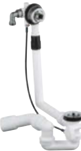
28 991 000 Talentofill inlet waste & overflow valve