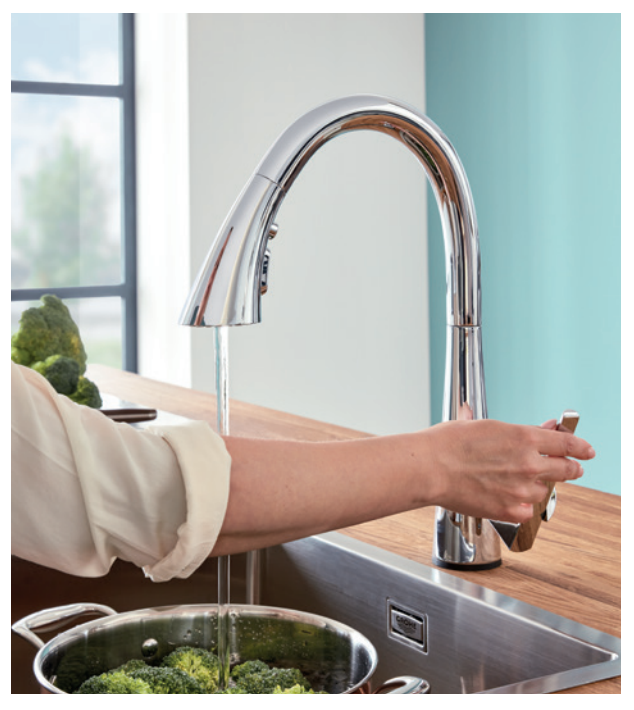
Control of the water flow via lever

Put the sweeping, sensual power of water at the center of your kitchen with the Zedra Touch. Zedra's distinctive fluted swivel spout and beautifully tactile lever combine ergonomic design with visual flair. The addition of GROHE's EasyTouch technology enables you to also control the water flow with just one touch. Choose your Touch function in the standard-version with an integrated mixing unit or upgrade with an under-sink Grohtherm Micro thermostat for perfectly controlled warm water and no danger of scalding.