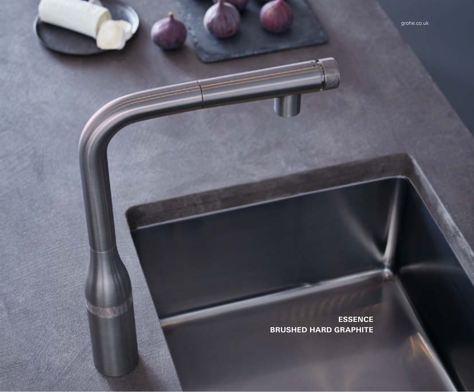
ESSENCE BRUSHED HARD GRAPHITE