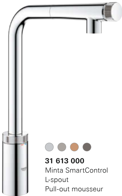
● ● ● ● 31 613 000 Minta SmartControl L-spout Pull-out mousseur