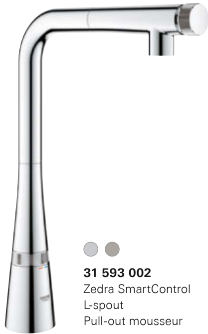
● ● 31 593 002 Zedra SmartControl L-spout Pull-out mousseur