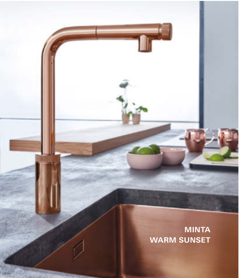
MINTA WARM SUNSET