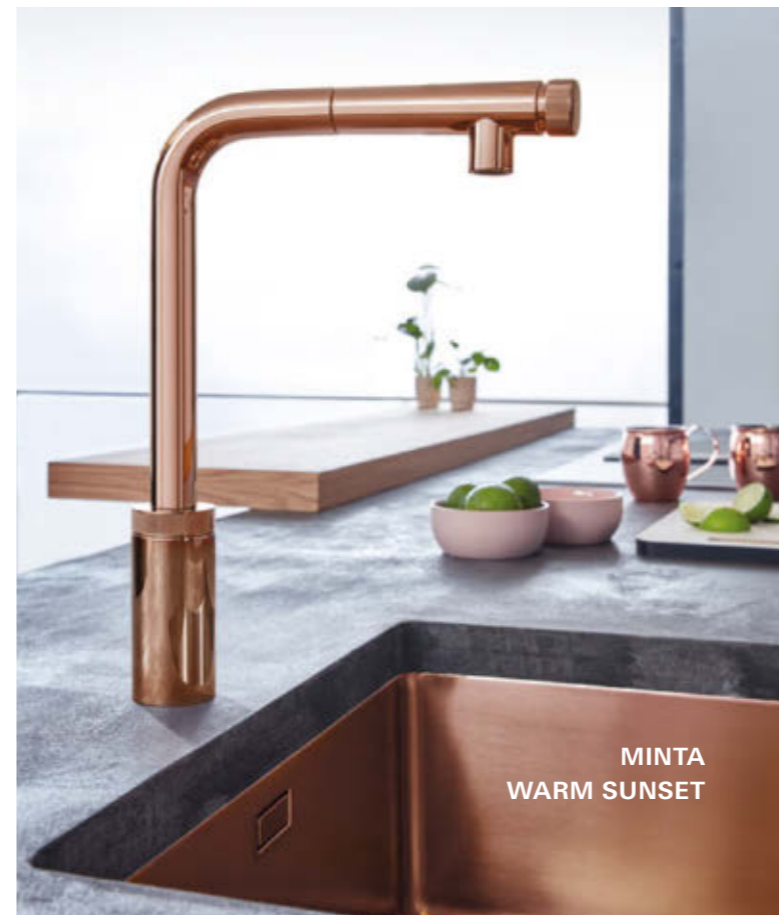
MINTA WARM SUNSET