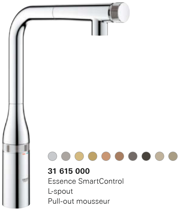
● ● ● ● ● ● ● ● ● ● 31 615 000 Essence SmartControl L-spout Pull-out mousseur