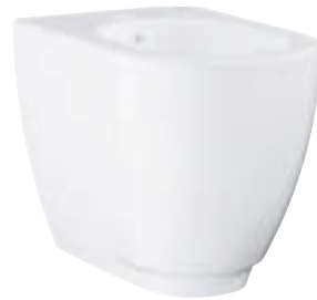
39 575 00H Floorstanding bidet