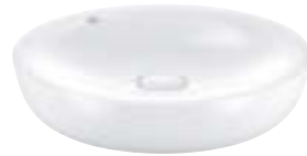
39 609 00H Vessel 45 cm

With Essence you will find all the power, performance and clever details you expect, concealed within an astonishingly slim, sleek, elegantly organic exterior.