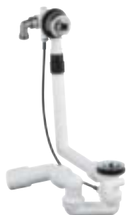
28 991 000 Talentofill inlet waste & overflow valve