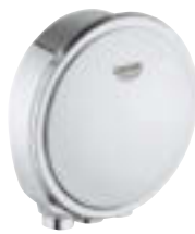
19 952 000 Talentofill trimset for waste set