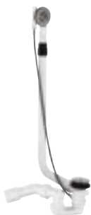
28 943 000 Talento pop-up waste