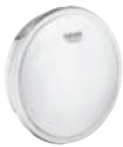
19 025 000 Talento trimset for waste set