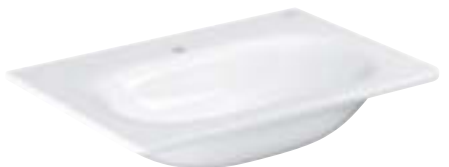
39 564 00H Wall hung basin 70 cm 39 565 00H 60 cm