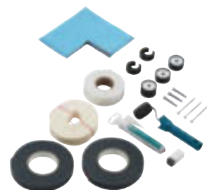
49 114 000 Sealing system