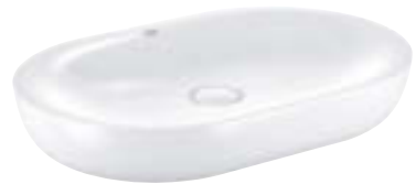
39 608 00H Vessel 60 cm