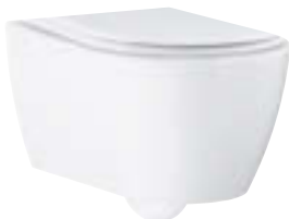
39 571 00H Wall hung WC 39 576 000 Seat & cover 39 577 000 Soft close