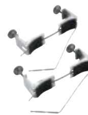
49 115 000 / SH0 Feet for built-in bath tub