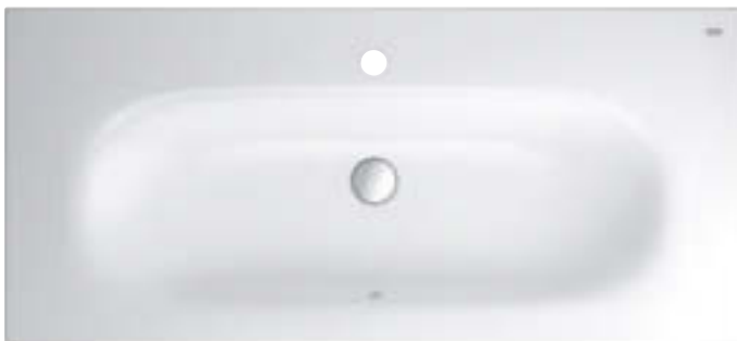
39 566 00H Vanity basin 100 cm 39 567 00H 80 cm 39 568 00H 60 cm