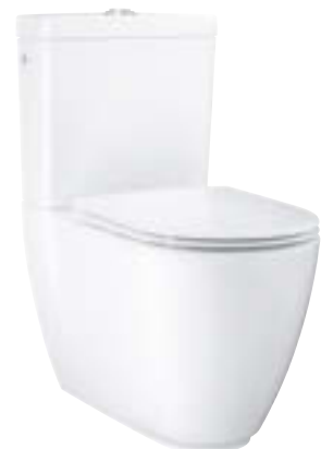
39 572 00H Floorstanding WC 39 579 000 Cistern with bottom inlet 39 578 000 Cistern with side inlet 39 576 000 Seat & cover 39 577 000 Soft close