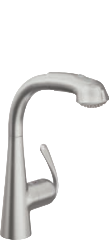
32 553 SD0 Zedra Sink mixer with pull-out spray

To fulfil its purpose, a kitchen fitting needs to be resistant. The only thing that needs to be more resistant is the materials it is made from. GROHE’s SuperSteel surface more than fits this bill. In fact, the innovative PVD coating is ten times more scratch-resistant than chromium. The silk-matt stainless steel surface not only looks unbelievably good, but also demonstrates its resistance in daily use. Fingerprints on the surface? Not here. And nowhere on the surface for microbes and bacteria to lurk either, which greatly reduces the microbial count. So the surface of the fitting stays hygienically clean, day after day.