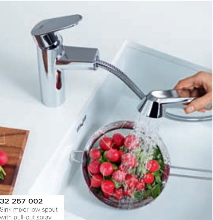
32 257 002 Sink mixer low spout with pull-out spray

You can choose between three different spout heights, different versions and countless installation options. Whatever choice you make, you are guaranteed an attractive appearance and easy operation over the lifetime of the faucet, thanks to GROHE SilkMove® cartridges and GROHE StarLight® chrome finish.