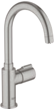
30 085 DC0 GROHE Red™ Mono faucet and boiler 4 liter