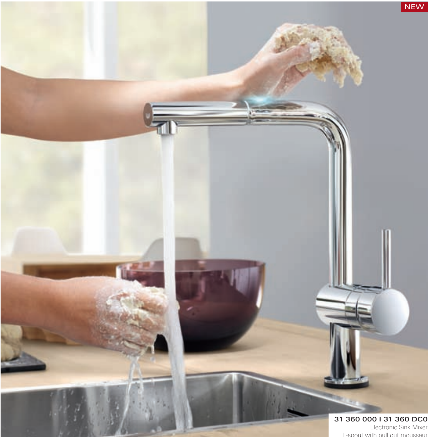
31 360 000 | 31 360 DCO Electronic Sink Mixer L-spout with pull out mousseur