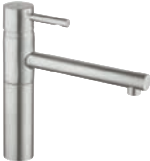
32 105 DC0 Essence Sink mixer