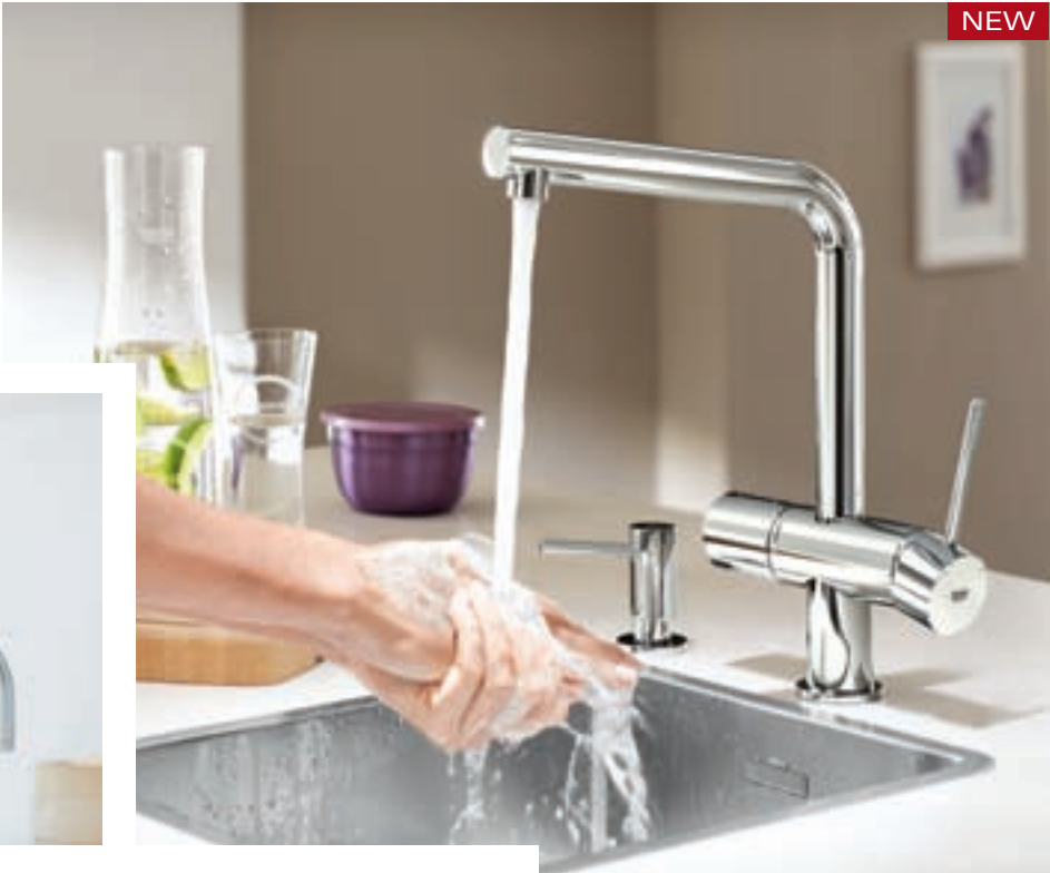
31 347 001 | 31 347 DC1 GROHE Blue® Minta Starter-Kit