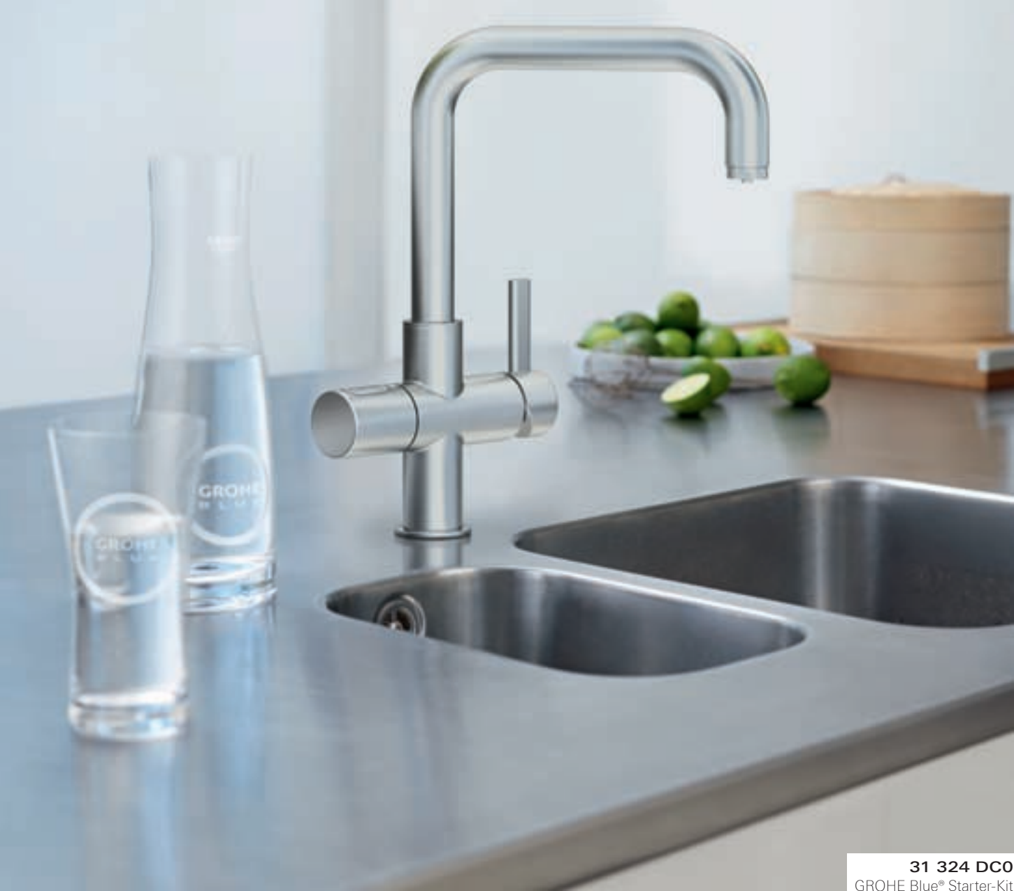
31 324 DC0 GROHE Blue® Starter-Kit