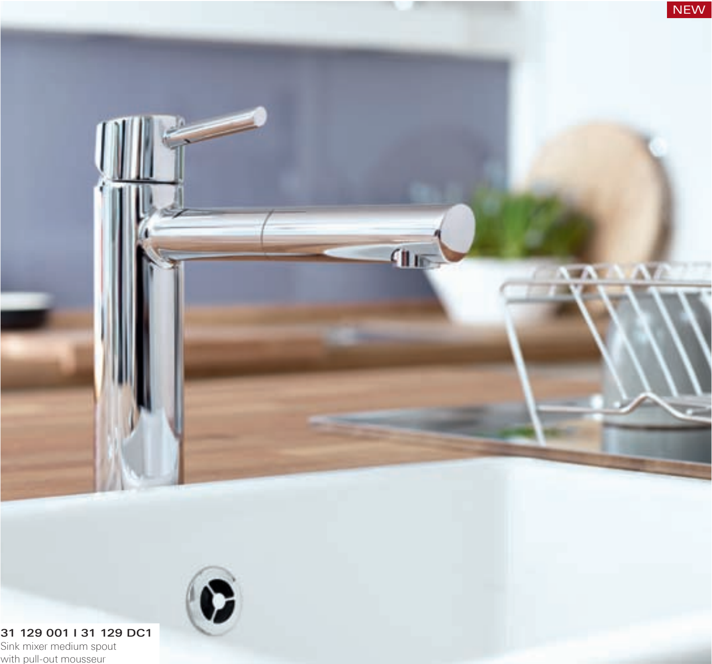
31 129 001 | 31 129 DC1 Sink mixer medium spout with pull-out mousseur

The new Eurosmart Cosmopolitan collection of kitchen faucets combines the clean, geometric lines of modern architecture with durable technology. They offer an impressive balance of modern aesthetics and excellent ergonomics. The swivel spout is convenient and easy to use – the ideal complement to any sink. Proven technologies such as GROHE SilkMove® for precise and smooth control and the high-gloss GROHE StarLight® chrome finish ensure the functionality and a flawless appearance, even after many years of use. The GROHE EcoJoy™ version of the Eurosmart Cosmopolitan kitchen faucet effortlessly saves water and energy. GROHE EcoJoy™ reduces the maximum flow rate to 5.7 litres per minute – although it will feel like much more. And all with an unbeatable price/performance ratio.