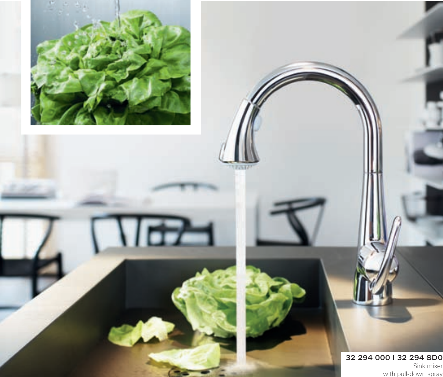
32 294 000 | 32 294 SD0 Sink mixer with pull-down spray