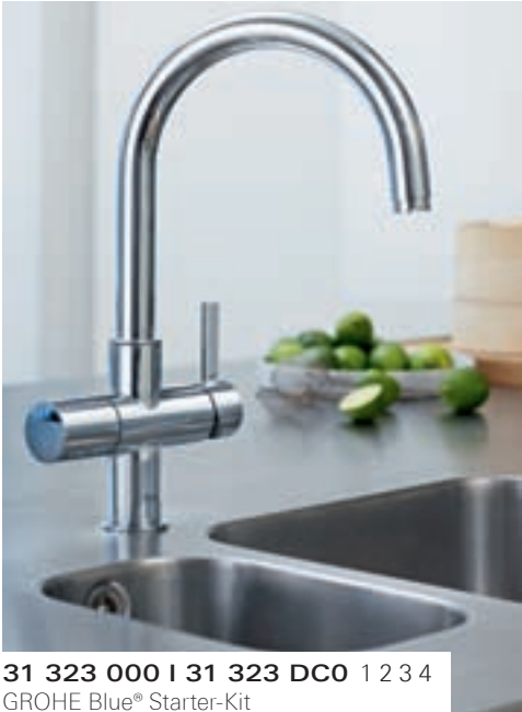
31 323 000 | 31 323 DC0 1 2 3 4 GROHE Blue® Starter-Kit