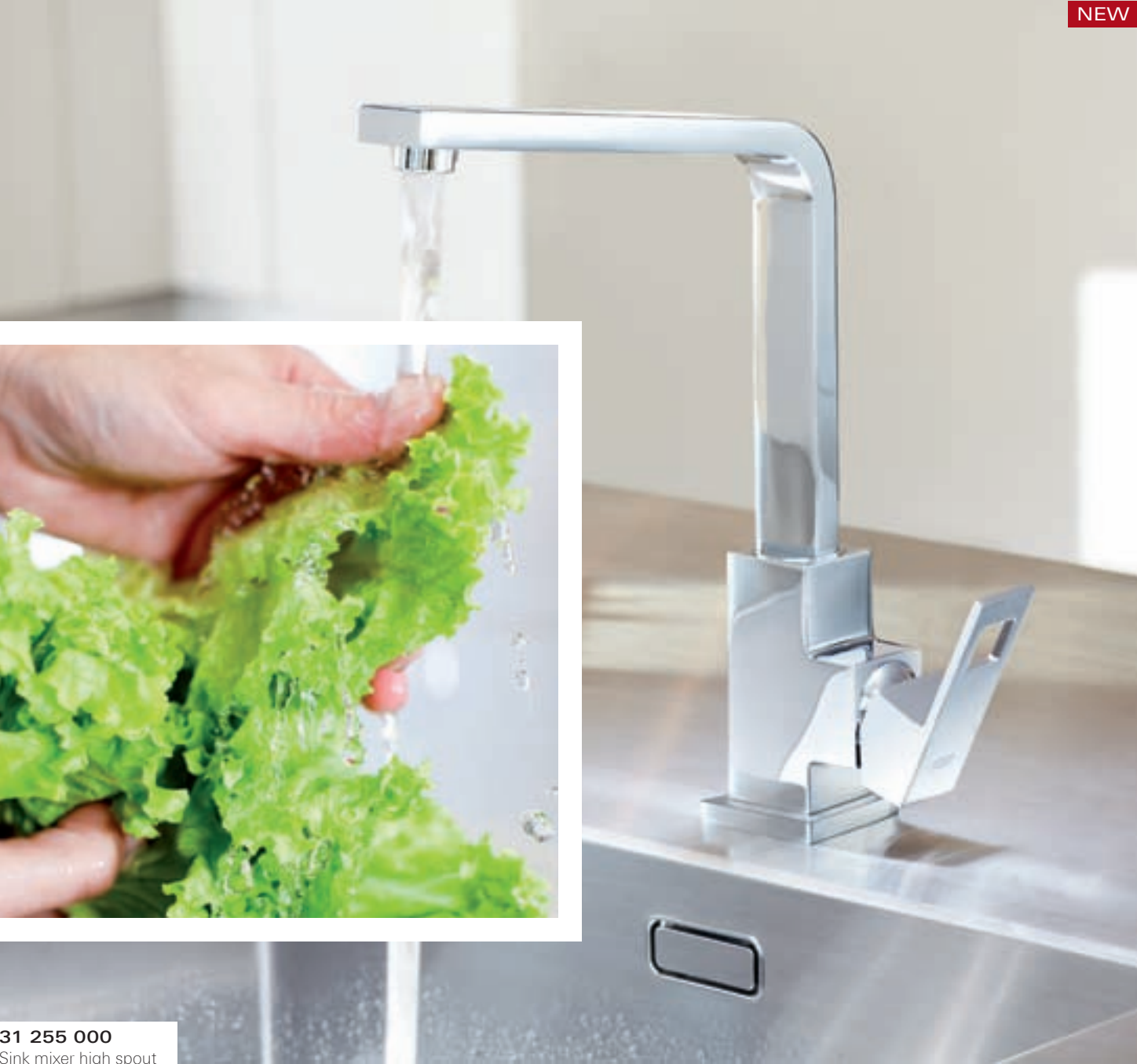
31 255 000 Sink mixer high spout

Naturally, Eurocube also benefits from two of our leading technologies: GROHE SilkMove®, for comfortable and precise control of the water flow and GROHE StarLight® for an intense chrome shine, which resists dirt and tarnishing and highlights its minimalist form.