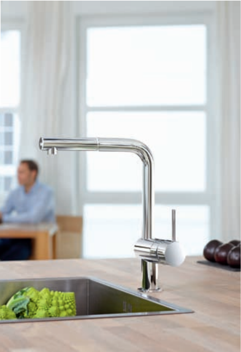
32 168 000 | 32 168 DCO Sink mixer L-spout with extractable mousseur