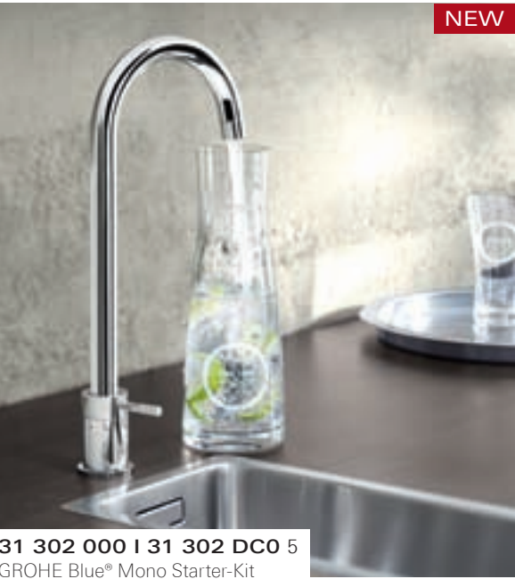
31 302 000 | 31 302 DC0 5 GROHE Blue® Mono Starter-Kit