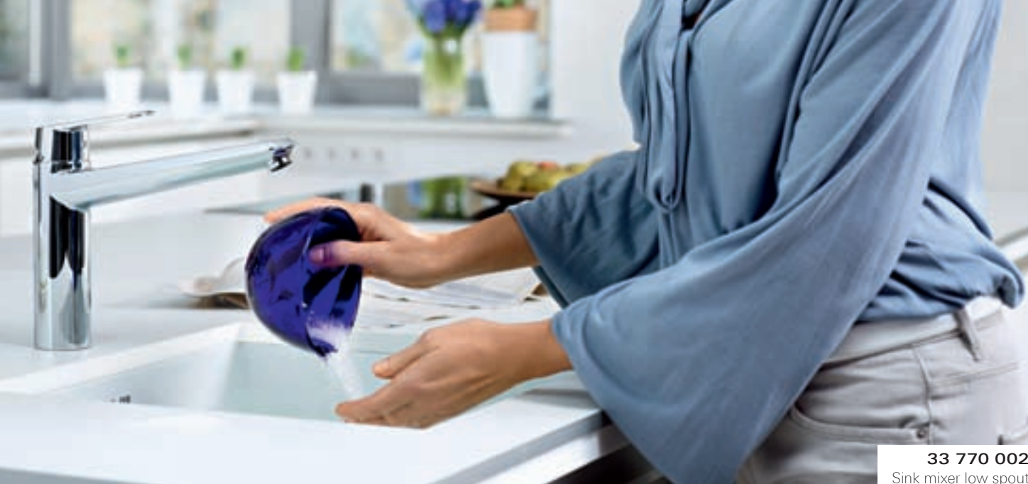
33 770 002 Sink mixer low spout