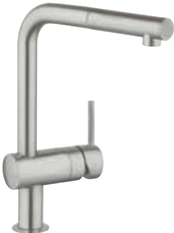
32 168 DC0 Minta Sink mixer L-spout with extractable mousseur