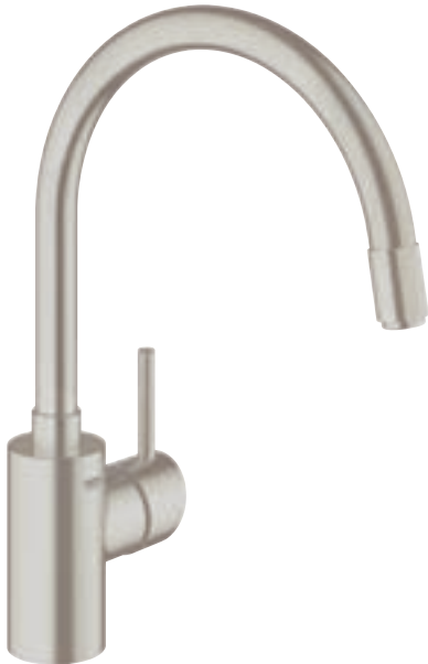
32 663 DC1 Concetto Sink mixer high spout with pull-out mousseur