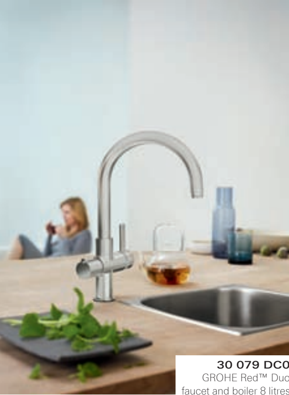
30 079 DC0 GROHE Red™ Duo faucet and boiler 8 litres