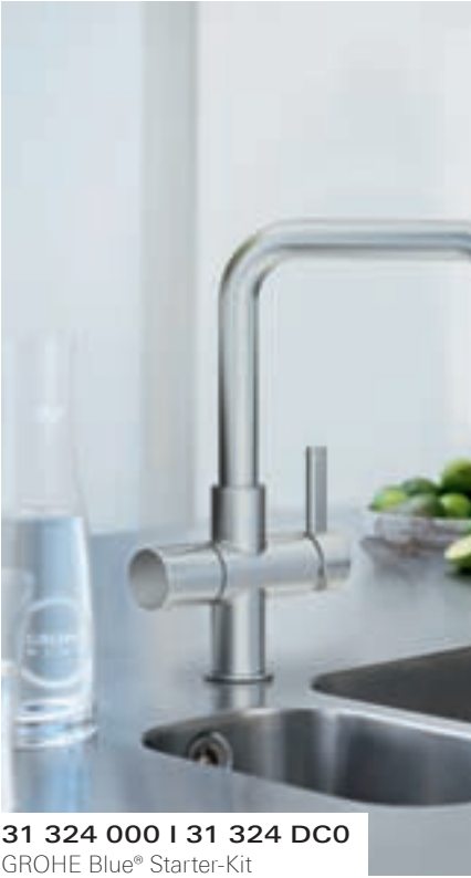
31 324 000 | 31 324 DC0 GROHE Blue® Starter-Kit