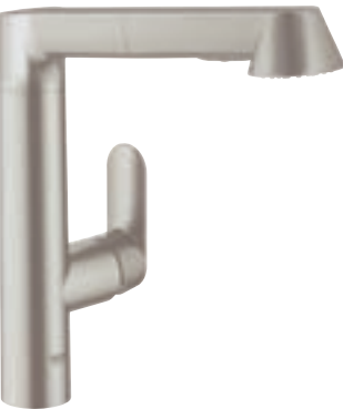
32 176 DC0 K7 Sink mixer with pull-out spray