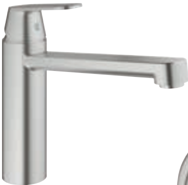
30 193 DC0 Eurosmart C Sink mixer medium height spout