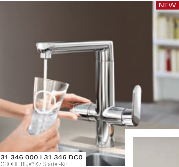
31 346 000 | 31 346 DC0 GROHE Blue® K7 Starter-Kit