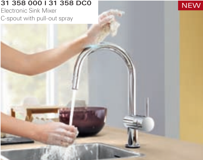
Simple activation/deactivation of the waterflow by touch.