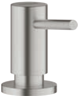
40 535 DC0 Cosmopolitan soap dispenser for liquid soaps storage bin 0.4 l