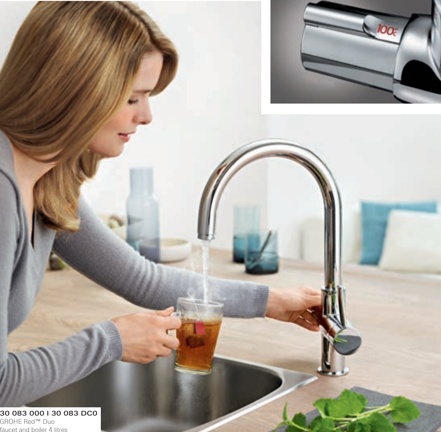
30 083 000 | 30 083 DC0 GROHE Red™ Duo faucet and boiler 4 litres

Boiling hot water. In the past you would have needed a pot or kettle, now it comes directly from the faucet. The innovative GROHE Red™ boiler system keeps four to eight litres of boiling water (depending on the boiler version) ready for immediate use at all times.