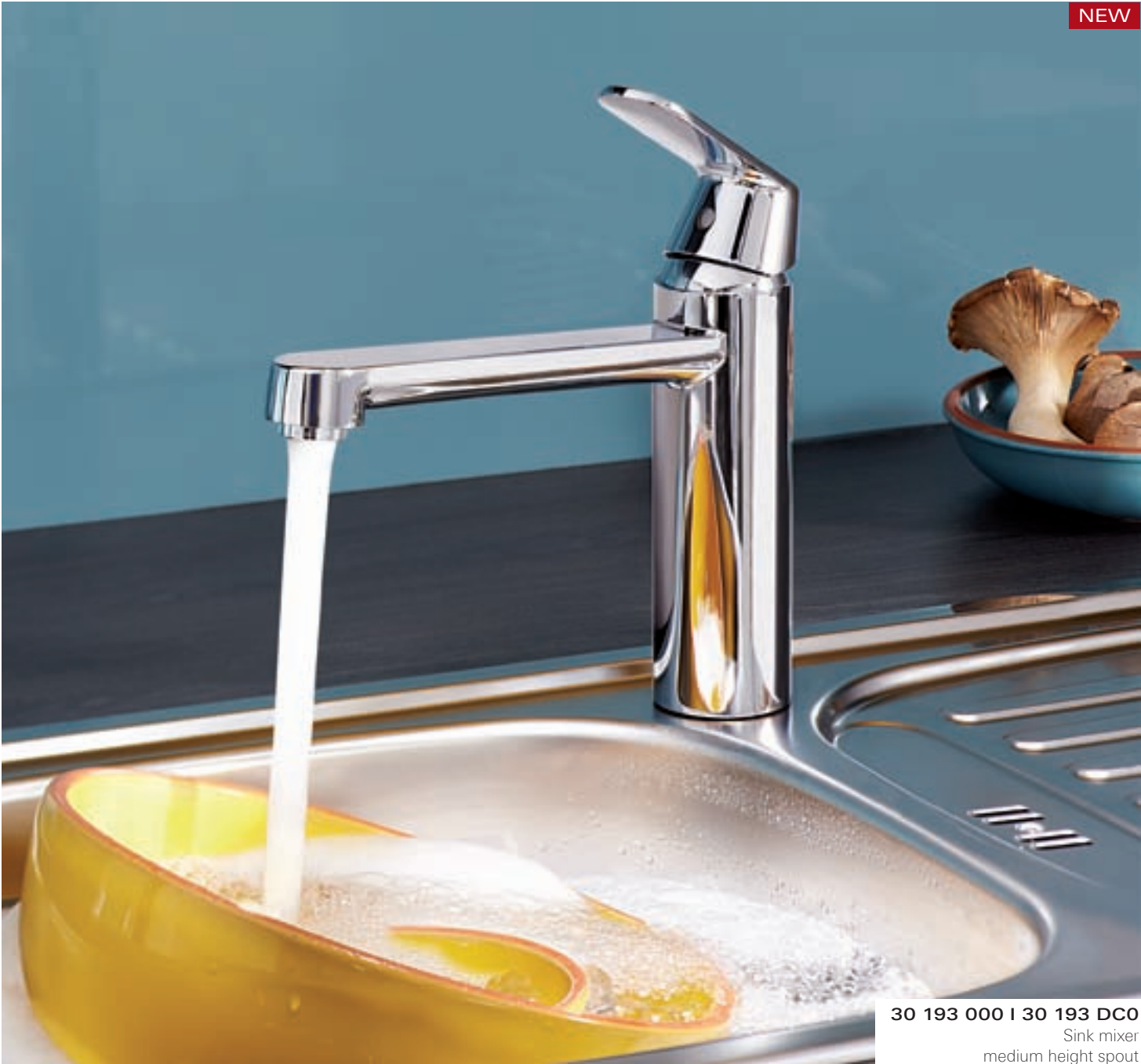
30 193 000 | 30 193 DC0 Sink mixer medium height spout